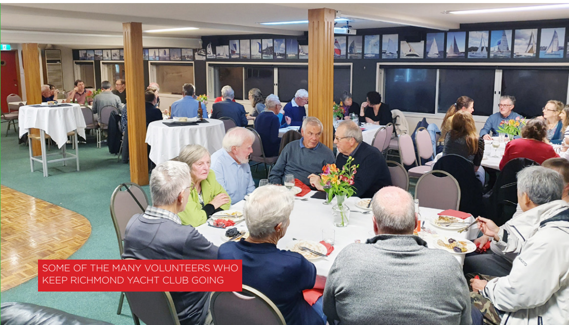
SOME OF THE MANY VOLUNTEERS WHO KEEP RICHMOND YACHT CLUB GOING